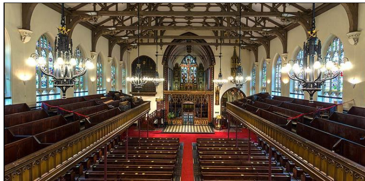
St. Paul's Church in Knightsbridge, London

A minimum of four groups must agree to perform for this concert to go forward; choirs of fewer than 60 voices perform a cappella, with more than 60 perform with members of the Oxford Philharmonic