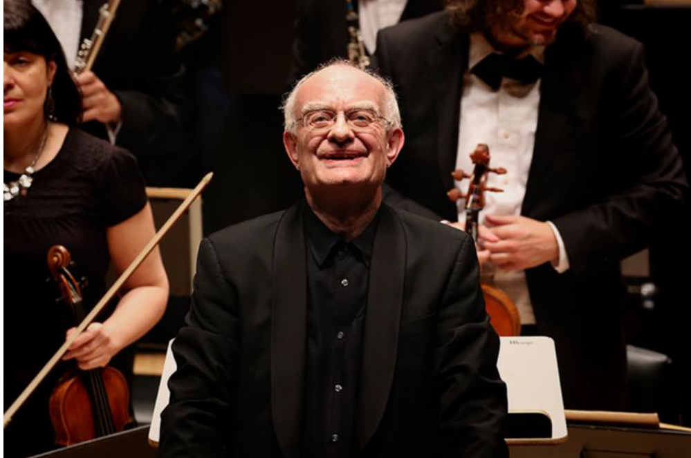
Maestro John Rutter

On Tuesday, June 27, 2023 8PM with the Oxford Philharmonic Orchestra