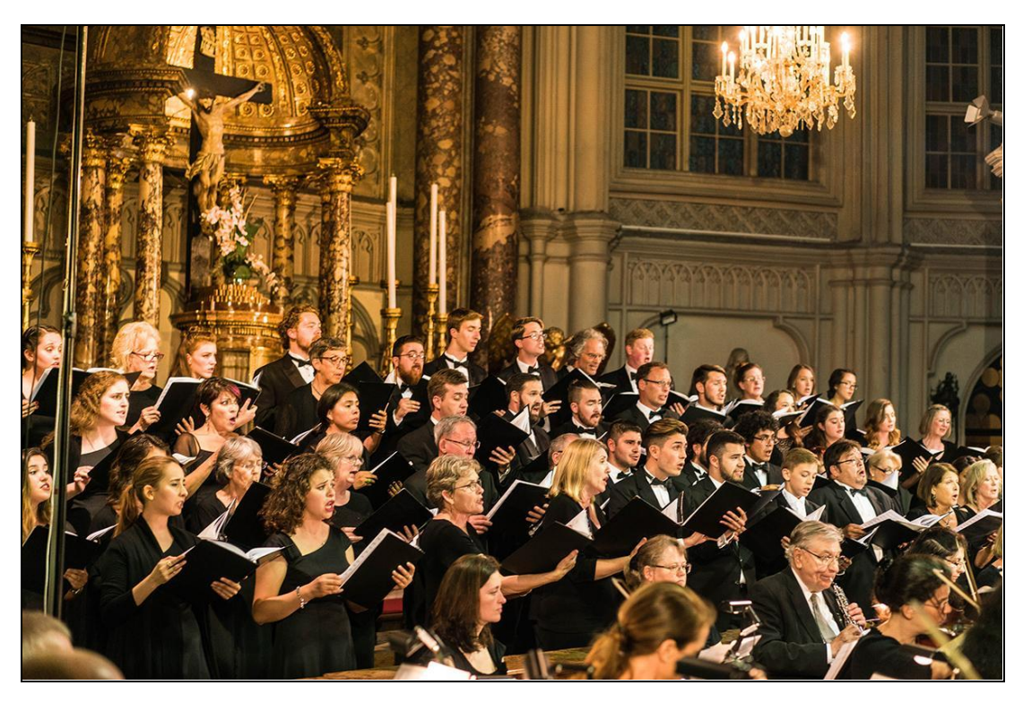
American choral artists perform at Minoritenkirche, Vienna