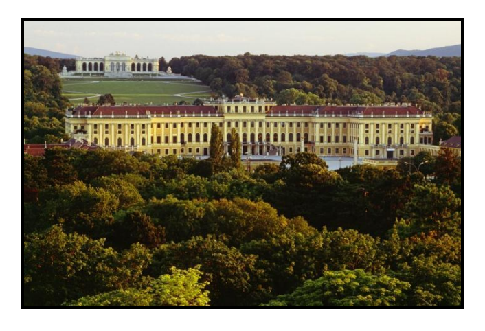
Schönbrunn Palace

descriptions courtesy of Vienna's Columbus Management.)