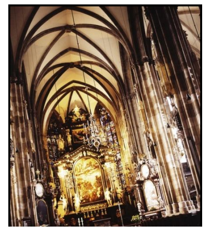
St. Stephen's Cathedral

Second Tour: We take you on a stroll through the atmospheric old city, seeing selected points of interest. You will discover some of the delightful features of Vienna and visit parts of the city only a true Viennese can point out.