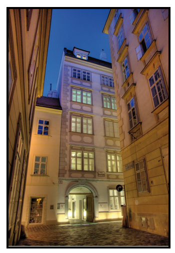
Mozarthaus Vienna