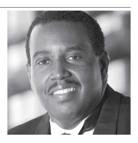
spiritual repertoire to schools, churches and community choirs.

His choral compositions have been performed by countless ensembles worldwide. His company, Onyx Choral Music Publishing, continues to successfully print and distribute his music for over 25 years. Onyx's mission has been to spread the good news of gospels and